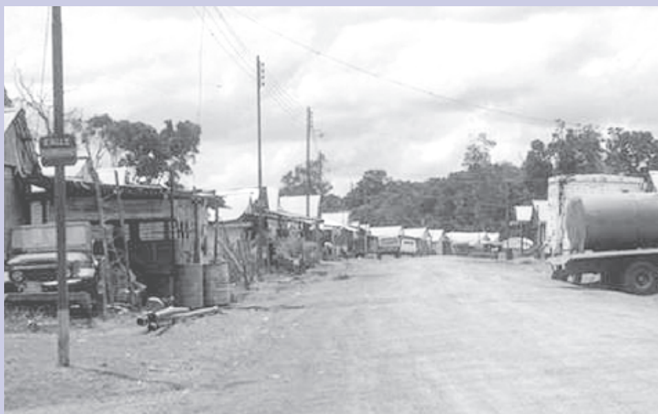
Venezuela: Rural settlement.