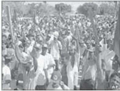
BBC News 3/31/04 "More Money for Brazil's Landless: Landless Brazilians are impatient with the rate of change." Source: < http://news.bbc.co.uk/2/hi/americas/3586943.stm >.