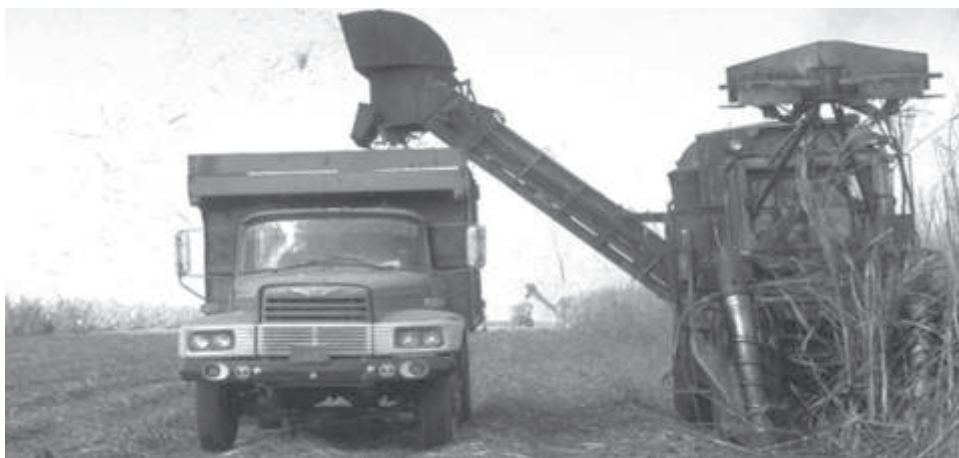
Cuba: Harvest time.

I had no illusions that Cuba was the socialist nation that it or other nations still claim it to be. It was clear to me that Cuba was a totalitarian state. I had read many histories of the nation and the revolution before I arrived and knew about its social programs that put the United States social infrastructure to shame, but while I had heard about the impoverished state of the people before I took my flight from Miami (yes, the United States has regular flights for those having business on the island), I did not understand what life was like there before I arrived. Walking through Havana, shopping in local grocery stores, and eating dinner with new Cuban friends over conversations about their “socialism,” I began to understand the extent of poverty Cubans faced. On the first and last night of my visit, I had run-ins with jineterismos (prostitutes), both male and female, and heard them glorify Fidel in the same breath they offered their body for money. I supported the black-market trade