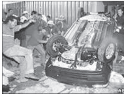
BBC News 6/7/06 "Landless Storm Brazilian Congress: The protesters say land reform is too slow."